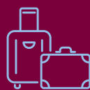
Large Bags or Suitcases (storage available with prior permission)