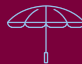
Umbrellas (except small fold up umbrellas)