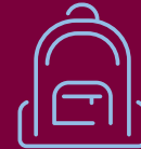
Small Bags/Backpacks (must be able to fit under seat)