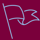
Flags or Banners (can be allowed with prior permission)